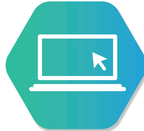
AUDIOVISUAL CONTENT LAB