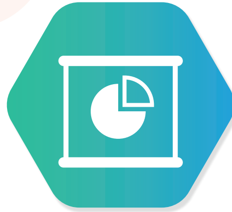
DIGITAL MARKETING INTELLIGENCE HUB